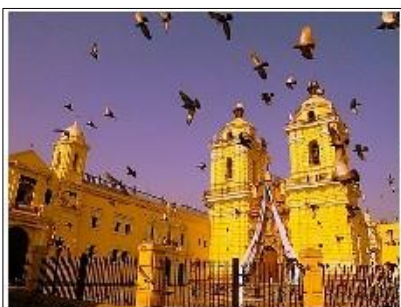
Convent of San Francisco

Larco Herrera Museum. In an 18th-century viceroy's mansion, this museum offers one of the largest, best-presented displays of ceramics in Lima. Founded by pre-Columbian collector Rafael Larco Hoyle in 1926, the collection includes over 50,000 pots, with ceramic works from the Cupisnique, Chimú, Chancay, Nazca and Inca cultures. Highlights include the sublime Moche portrait vessels, presented in simple, dramatically lit cases, and a Wari weaving in one of the rear galleries that contains 398 threads to the linear inch – a record.