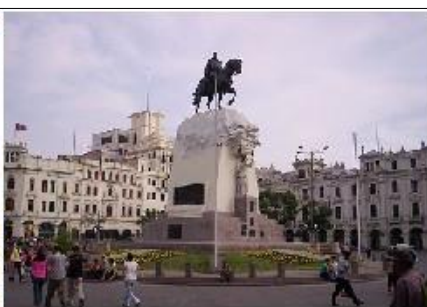
Square of San Martin